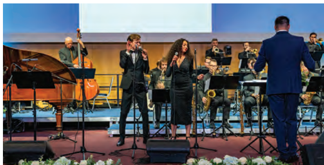
The performers of the University Jazz Gala Concert