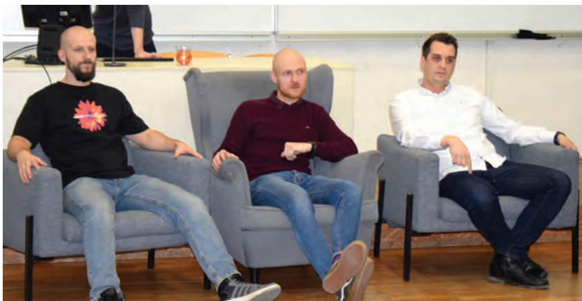
Tea Party panelists

Tea with a Civil Engineer is typically held three times during the academic year—once in the winter semester and twice in the summer semester. ■