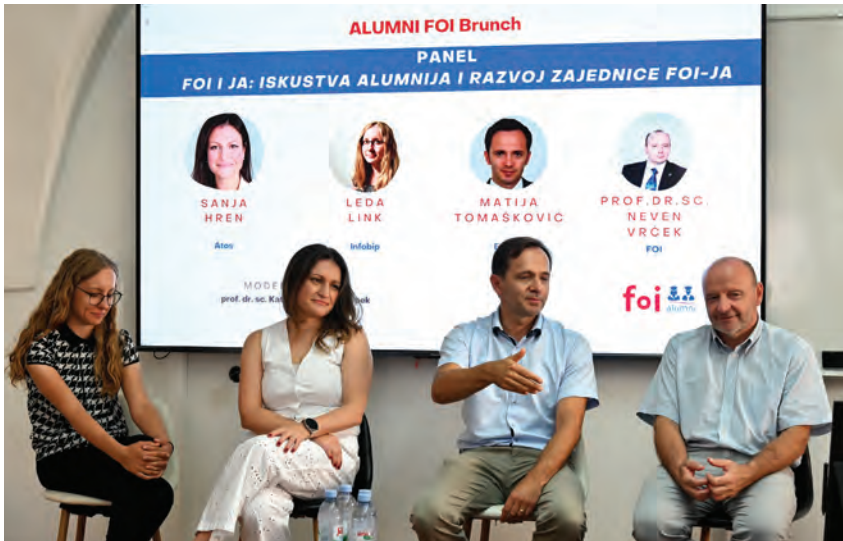
Participants of the panel discussion at FOI and me