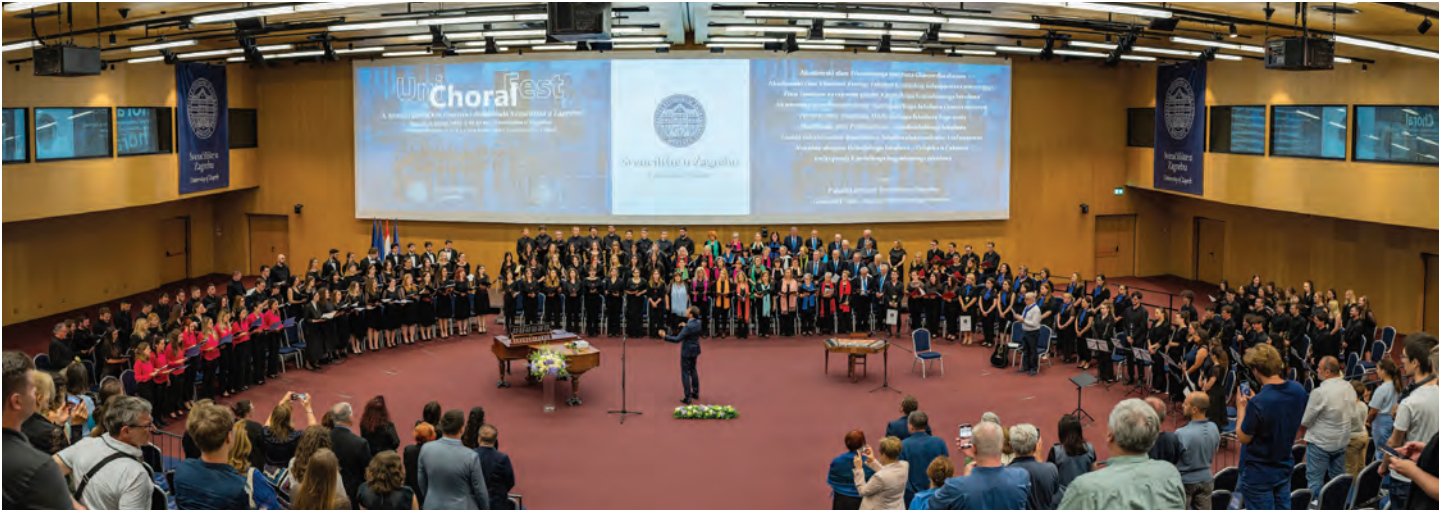
Performers and guests of the Uni Choral Fest in the ceremonial hall of the University of Zagreb