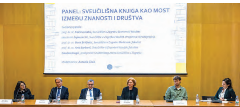
Participants of the panel discussion