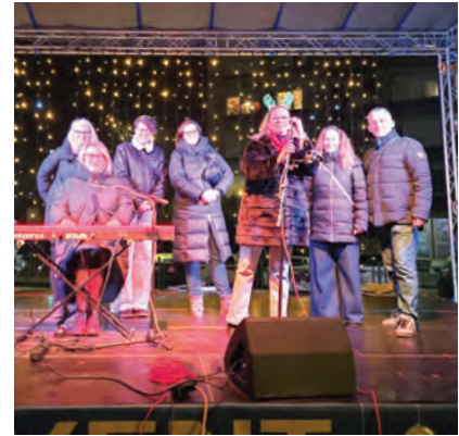
Members of the Presidency of AMAC-UFZG

For the fifth year in a row, students have organized this humanitarian event. The rich and diverse program includes performances by both professional and amateur musicians, with the University Choir Review standing out in particular. Alongside