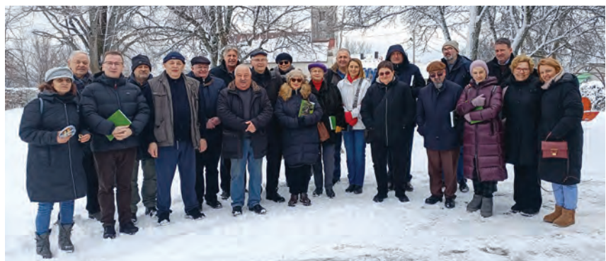
Visit to the Parish of Saint Michael in Kalje