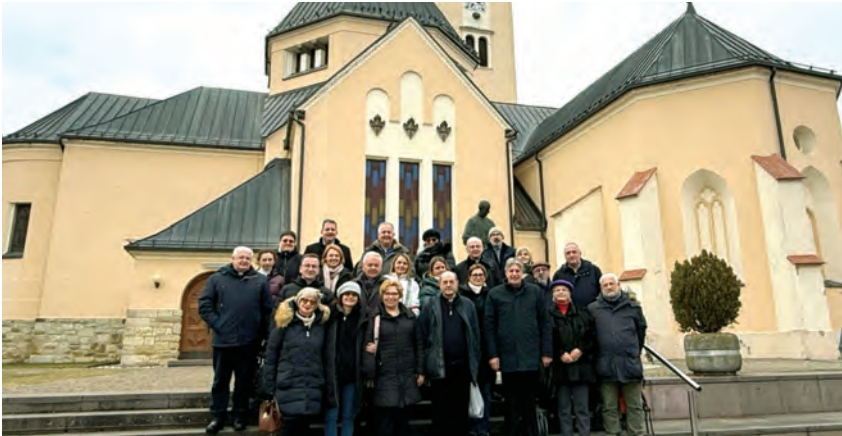
In front of the Church of the Most Holy Trinity in Krašić

On Saturday, February 15, 2025, the Society of Former Students of the Catholic Faculty of Theology of the University of Zagreb / Almae matris alumnae et alumni Croatiae – Facultas Theologiae Catholicae (DBS-KBF / AMAC-FTC) solemnly celebrated its Day – Stepinac Day 2025.