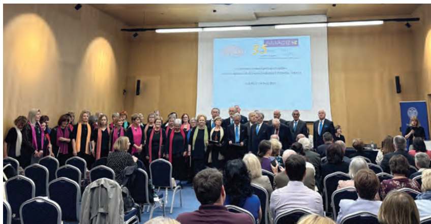
Performance of the Academic Choir Vladimir Prelog

On Wednesday, May 14, 2025, the 35th Annual Assembly of AMACIZ, the first alumni association established at the University of Zagreb, was held at the temporary headquarters of the University Rectorate (SEECEL). The Assembly began with the performance of the anthems (Croatian and European) by members of the Vladimir Prelog Academic Choir, which operates within AMACIZ.