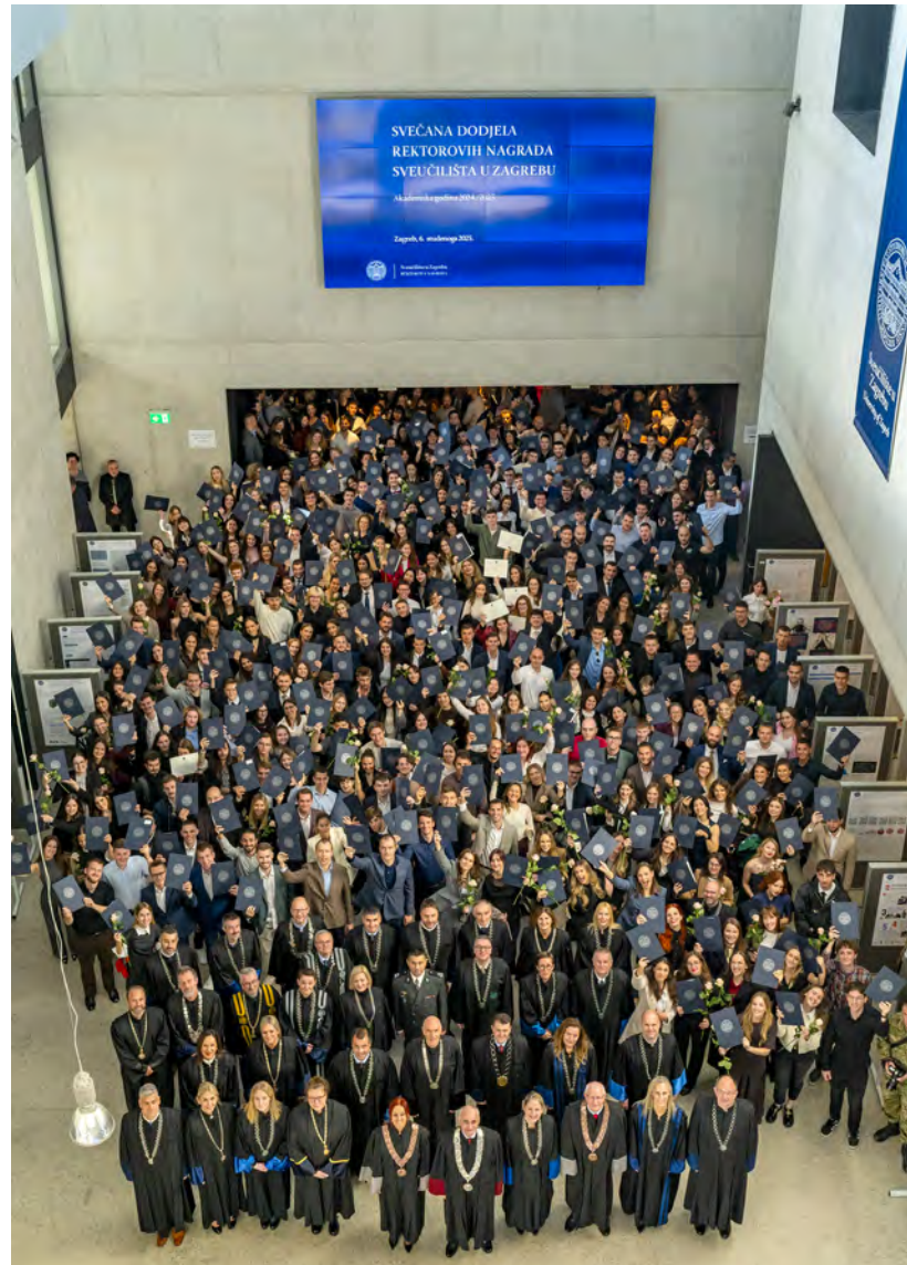
Recipients of the Rector's award

UNIVERSITY WEEKLY NEWS, pp. 3–11 source: University website