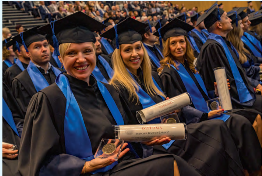
Newly awarded PhDs

According to the Third International Handbook of Lifelong Learning (2023), most trends from previous periods are expected to continue in the future, but with faster progress. Increasing digitalization, the use of online platforms, virtual classrooms, and digital tools are anticipated, enabling flexible and accessible learning regardless of location or time. There will be growing efforts to customize content and teaching methods to the individual needs of learners, so-called personalized learning pathways. Learning analytics and artificial intelligence play an important role here. The Faculty of Organization and Informatics at the University of Zagreb has a Laboratory for Learning Analytics and Academic Analytics, which brings together researchers and practitioners to apply research for improving the quality of learning and teaching. Additionally, responding to labor market needs will continue to require strong partnerships and collaboration between educational institutions, employers, and industry. Such collaboration can result in new reskilling and upskilling programs. ■