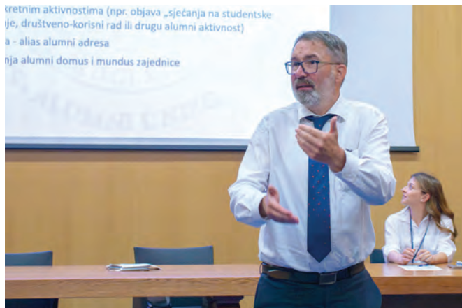
The President of the ALUMNI UNIZG Association