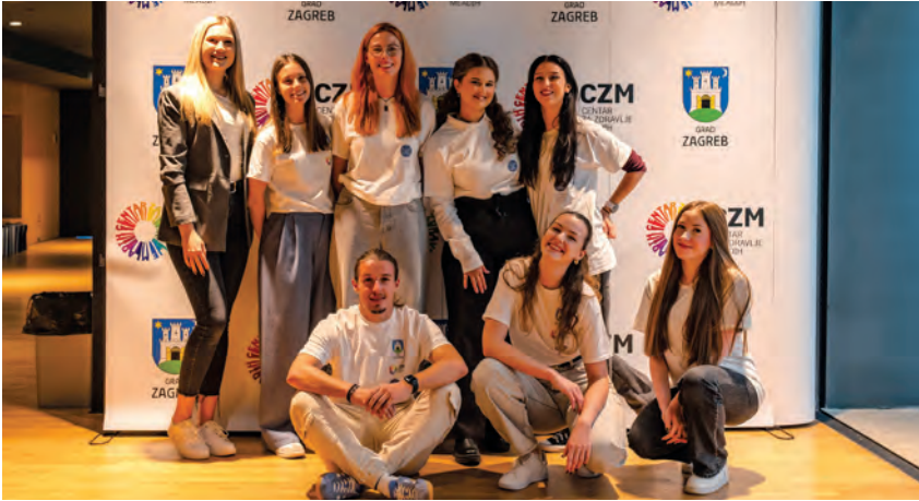
Volunteers at the Youth Health Center

On the occasion of World Mental Health Day, a series of events was held on Friday, October 10, 2025, at the University of Zagreb, jointly organized by the City of Zagreb, the Youth Health Center of the Zagreb-East Health Center, and the University of Zagreb Student Counseling Center. In the University's ceremonial hall, located in the building of the Regional Center for the Development of Entrepreneurial Competencies for Southeast European Countries – SEECEL, the 4th Zagreb Mental Health Symposium with international participation took place under the