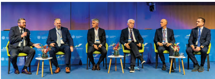
Panel participants Education, scientific research, and partnership with the economy

The first Economic Forum of the University of Zagreb demonstrated that synergy between knowledge, entrepreneurship, and public institutions is key to developing a competitive and innovative Croatia. It also established a platform for further cooperation and concrete projects that will shape the future of the economy and society. ■