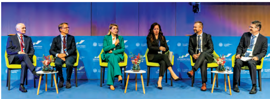
Panel participants The role of the University of Zagreb in achieving a competitive and innovative Croatia

At the forum, the Award for Economic Excellence – the Academic Oscar – was also presented. This award is given to companies that have achieved outstanding collaboration with the University and contributed to innovation, the community, and the international recognition of Croatia. This year, the award was presented to Končar d.d. and DOK-ING d.o.o. for innovative projects in energy, digitalization, infrastructure, urban mobility, robotics, automation, defense, and security.