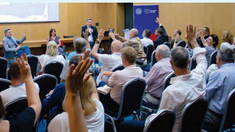
guests of Alumni Stories and the audience