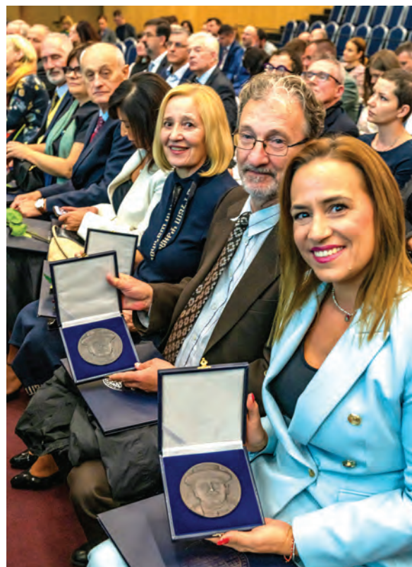
Recipients of the University of Zagreb awards