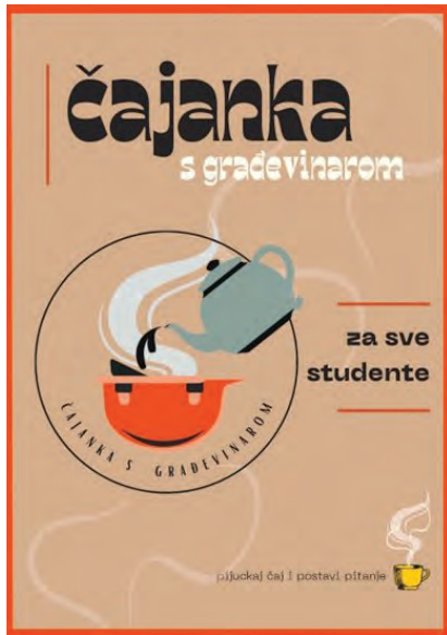
Tea Party poster

Tea with a Civil Engineer is an informal panel discussion where students have the opportunity to hear the experiences of former students, faculty members, and employers, and to ask the panelists questions that interest them. The event is organized in collaboration between the Career Center of the Faculty of Civil Engineering and the Vice Dean for Academic Affairs. The purpose of the event is to bring students closer to personal experiences from university studies and professional life, present different career paths, and provide useful first-hand advice. The goal is to answer the question of what professors and employers expect from students and how students can develop their potential already during their studies. The idea behind Tea with a Civil Engineer stems from the desire to help students better connect with their professors, teaching assistants, and potential employers in an informal, relaxed, and friendly environment. This informal setting enables open communication, exchange of experiences, and the building of mutual trust. The event also responds to the need for advisory and motivational workshops, which students have recognized as highly beneficial for their personal and professional development.