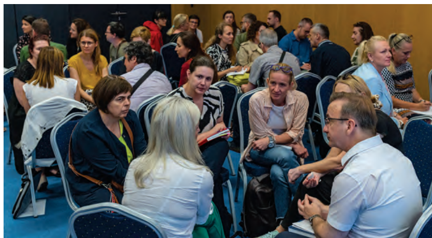
Participants in the lifelong learning program

International collaboration provides a unique opportunity to exchange knowledge, experience, and best practices,